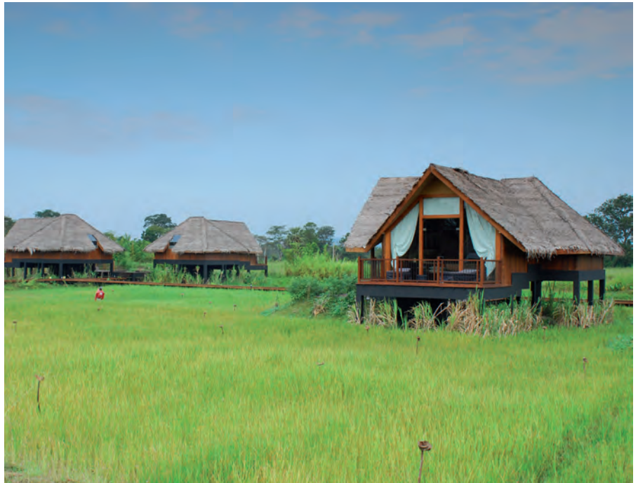
Jetwing Vil Uyana, Sigiriya