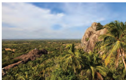
The Mudhouse, Anamaduwa