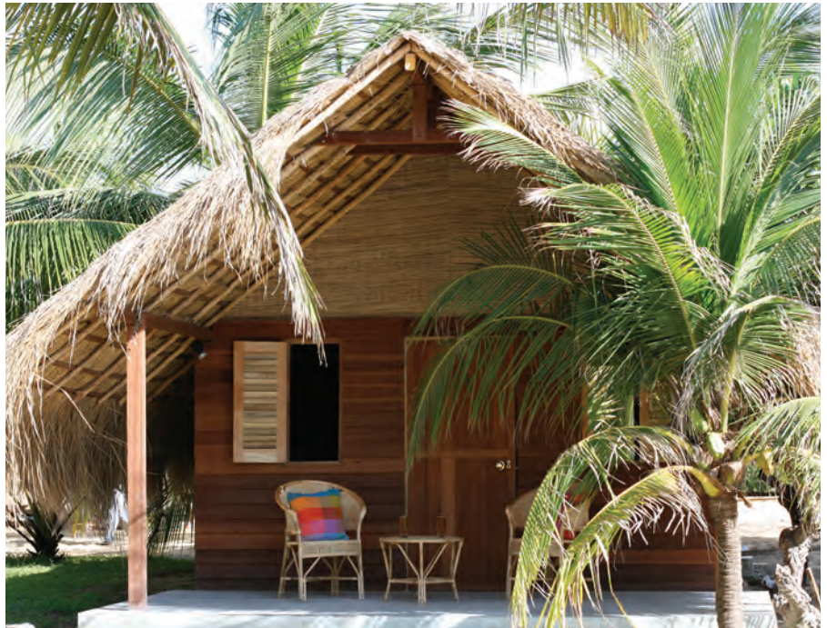
Palagama Beach Resort, Kalpitiya

In the ancient rural heart of Sri Lanka, The Mudhouse sits in a remote location about two hours' drive north of Colombo airport. Clusters of uniquely designed huts are located amidst 60 acres of forest land and have been built from local, natural materials, resembling all sorts of structures from a traditional village house to a tree house. Whilst each 'house' is different in layout and appearance, all have been designed with relaxation and comfort in mind and all the facilities are essentially the same, with outdoor showers and indoor bathrooms. All huts have dining areas and spaces which can be used for yoga and meditation. During your stay you have a number of different huts and structures allocated to you to 'call your own'. There is no mains electricity, but lighting at night is provided by candles and lanterns and the staff hut has solar panels and a limited supply of power for charging batteries. Guests stay on full board, eat in the main dining hut and meals are prepared in the traditional kitchen, mostly with firewood and clay pots, using much produce from the Mudhouse's own farm and garden. Guests are welcome to get involved with planting, watering or picking the produce. A stay here is an incredible experience in its own right but also for visiting local lakes and temples, bird watching and to visit the ancient city of Anuradhapura and sites of the Cultural Triangle. read more