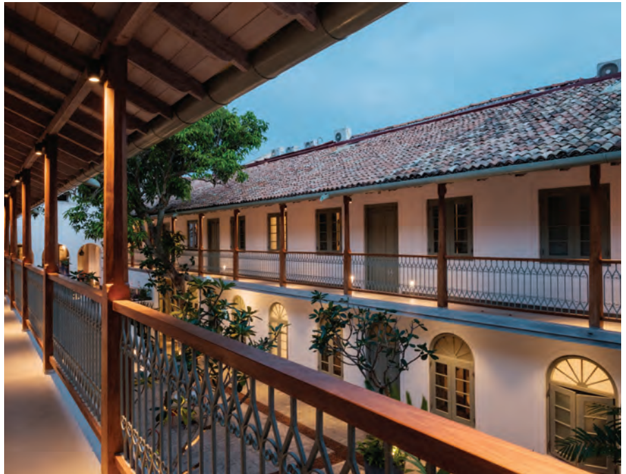
Fort Bazaar, Galle