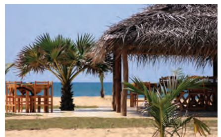
Palagama Beach Resort, Kalpitiya