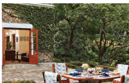
Jetwing Warwick Gardens, Ambewela