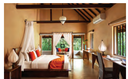
Jetwing Vil Uyana, Sigiriya