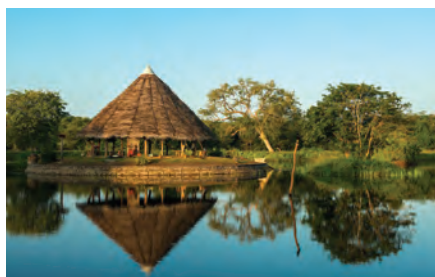
The Mudhouse, Anamaduwa

canopied beds, and exposed wood. The Coralia Restaurant specialises in flavoursome Sri Lankan cuisine, including hoppers, rice and curry, and Watalapam. Cookery classes with the chef are also available to those guests who wish to take a long-lasting souvenir with them when they leave. Other once-in-a-lifetime activities include dolphin- and whale-watching excursions; alternatively, soak up the serene Sri Lankan atmosphere from under the open-sided spa cabana, while enjoying a luxurious massage. Palagama Beach envelopes guests in a true sense of rural Sri Lanka, surrounded by trees, sand, and sea, thus making an excellent stop-off point on a luxury tour of Sri Lanka. We would recommend combining Palagama Beach with stays in modern resorts and inland villas to ensure you witness every side of this diverse island. read more