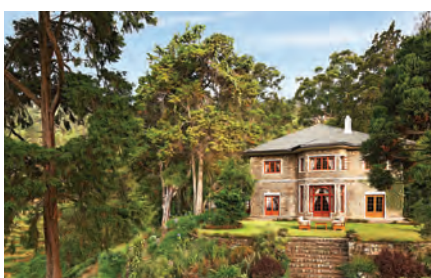
Jetwing Warwick Gardens, Ambewela

The Island Spa provides calming surroundings in which to relax with a treatment and guests will also be able to make use of the yoga pavilion. Specialist ayurvedic treatments are administered in a separate pavilion in the grounds. An excellent range of excursions are possible to explore the local area, from the Sigiriya Rock Fortress, which can be seen in the distance from the hotel, to elephant safaris, Loris watching in the hotel grounds and visits to the local village. Jetwing Vil Uyana near Sigiriya in Sri Lanka's Cultural Triangle combines luxurious surroundings with a real commitment to the local environment and its people. read more